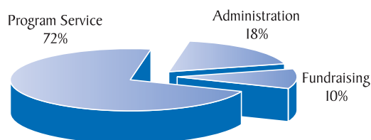
Expenditures by Function

Seventy-two percent of expenditures went to program services, 18 percent to administrative expenses – even as the Association continues a leadership role in speaking on behalf of and advocating for the sector.