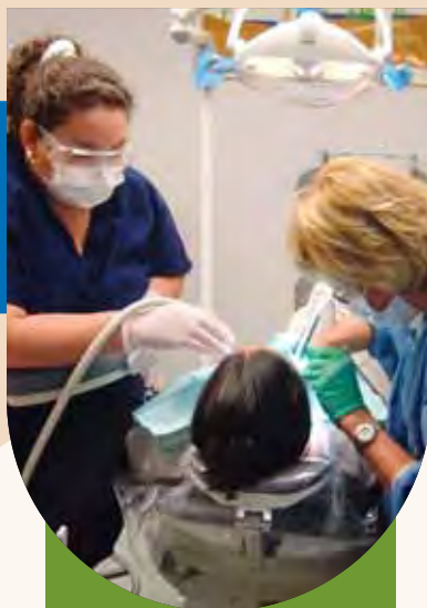
Inner City Health Center