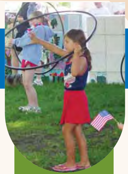
American Civil Liberties Union Foundation of Colorado