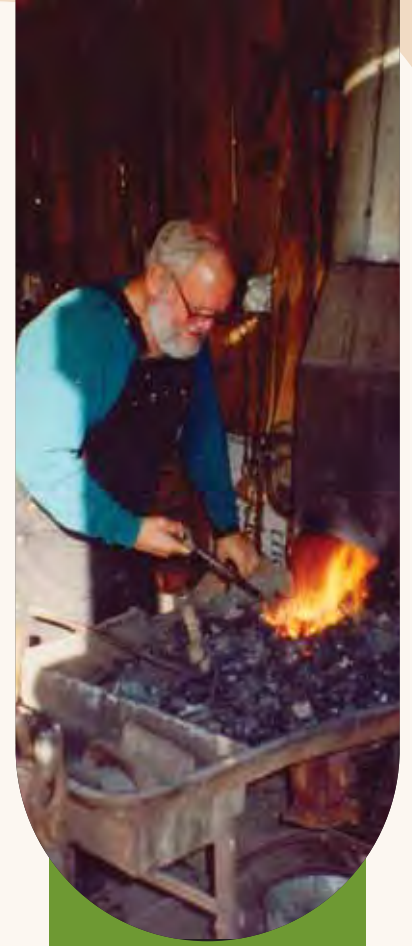
Four Mile Historic Park